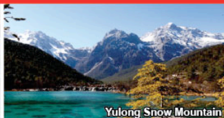
Yulong Snow Mountain