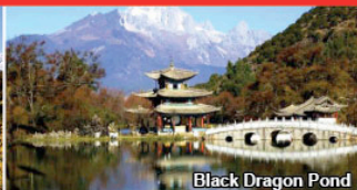
Black Dragon Pond