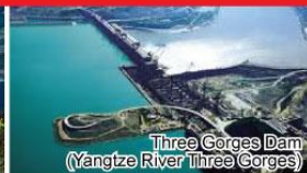
Three Gorges Dam (Yangtze River Three Gorges)