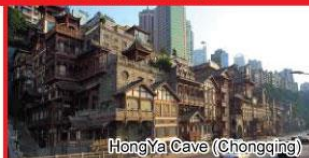
Hong Ya Cave (Chongqing)