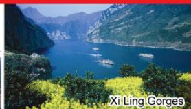
Xi Ling Gorges