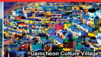
Gamcheon Culture Village