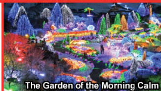
The Garden of the Morning Calm